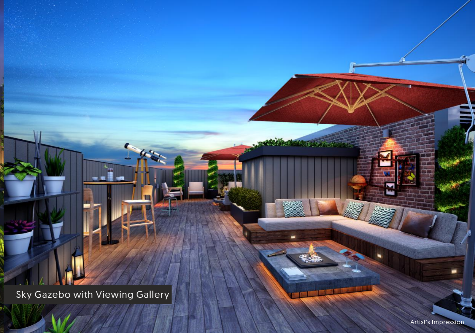
Sky Gazebo with Viewing Gallery