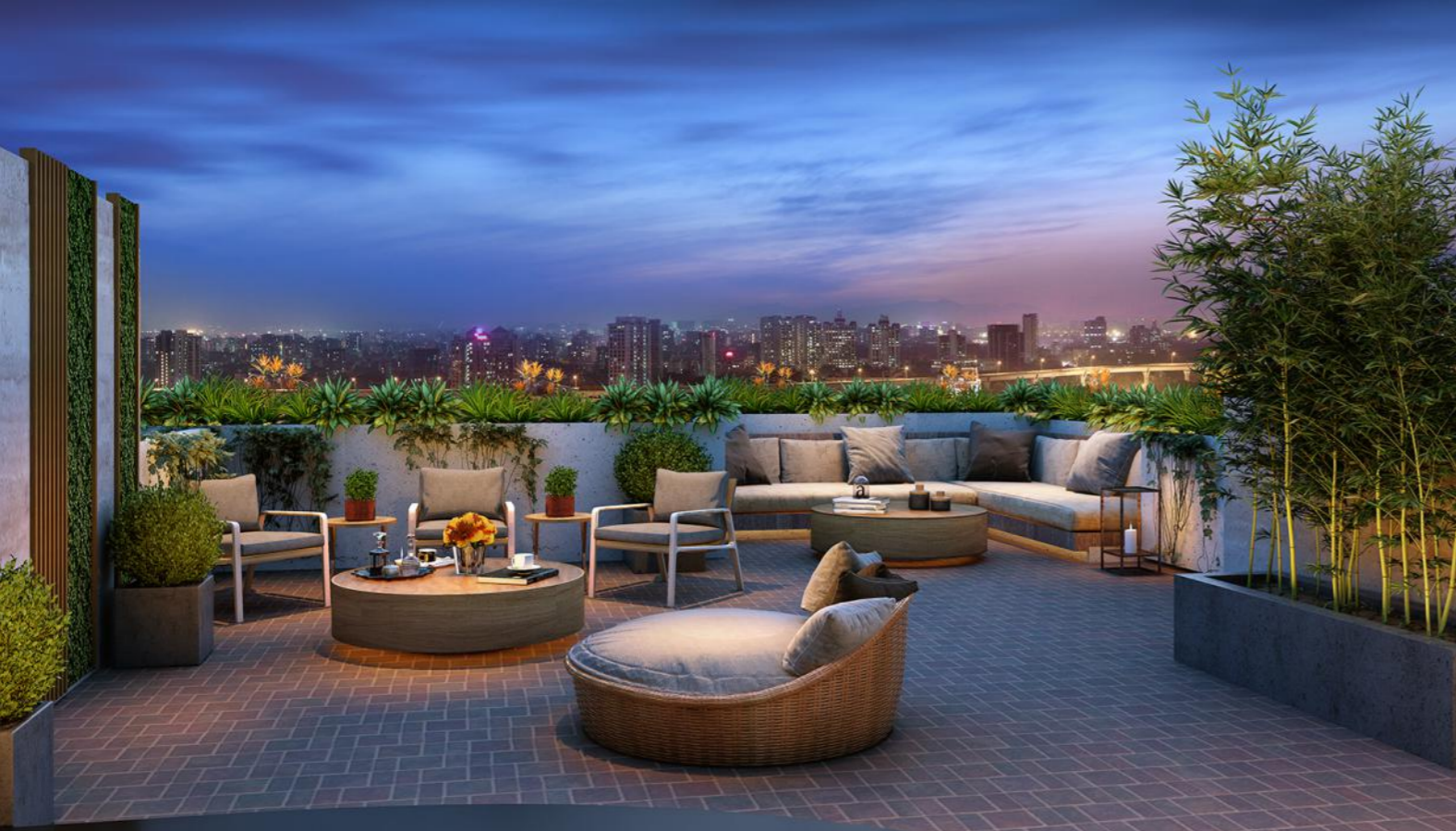
Sky Lounge with Luxury Sit-outs