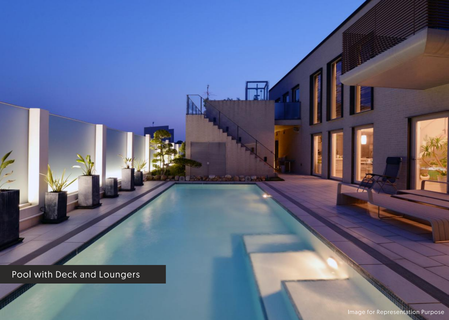
Pool with Deck and Loungers