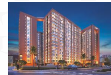
PLATINUM LIFE ANDHERI (W)