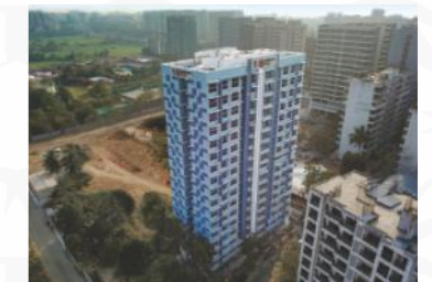
PLATINUM TOWER - 1 ANDHERI (W)