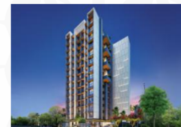
PLATINUM PRISTINE ANDHERI (W)