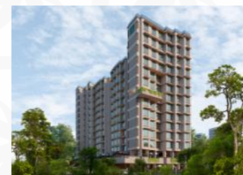
PLATINUM PARK ANDHERI (W)