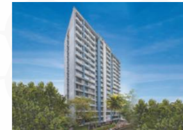
PLATINUM TOWER - 4 ANDHERI (W)