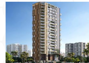
PLATINUM VISTA KHAR (W)