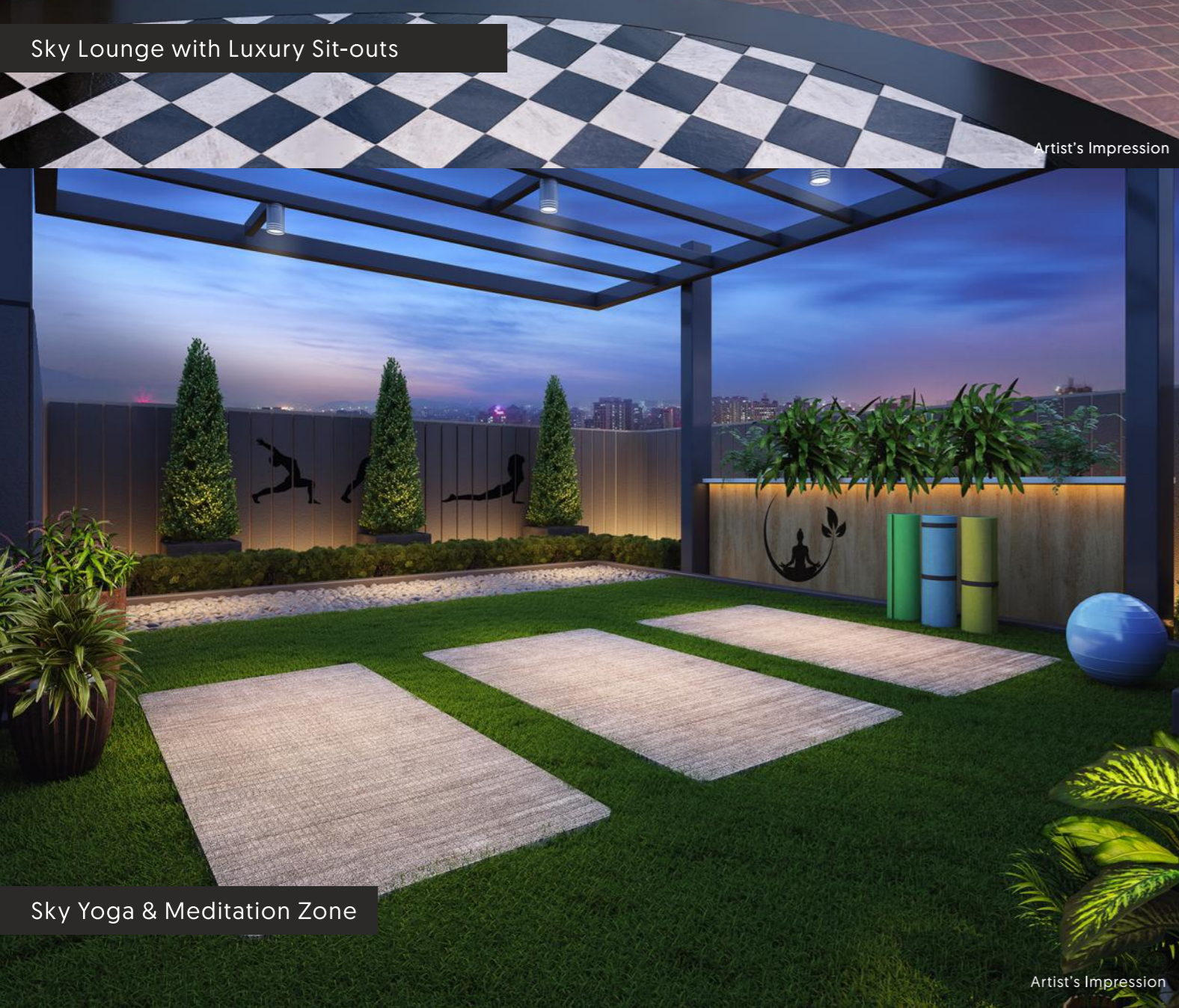
Sky Yoga & Meditation Zone