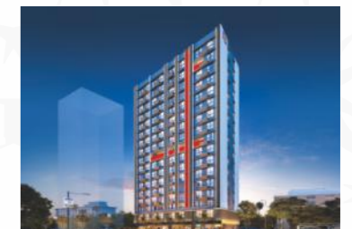
PLATINUM CASA MILLENNIA ANDHERI (W)