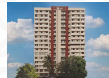
PLATINUM PRIVE ANDHERI (W)