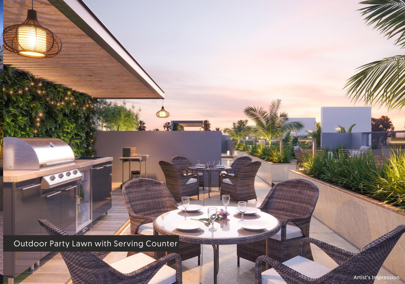
Outdoor Party Lawn with Serving Counter