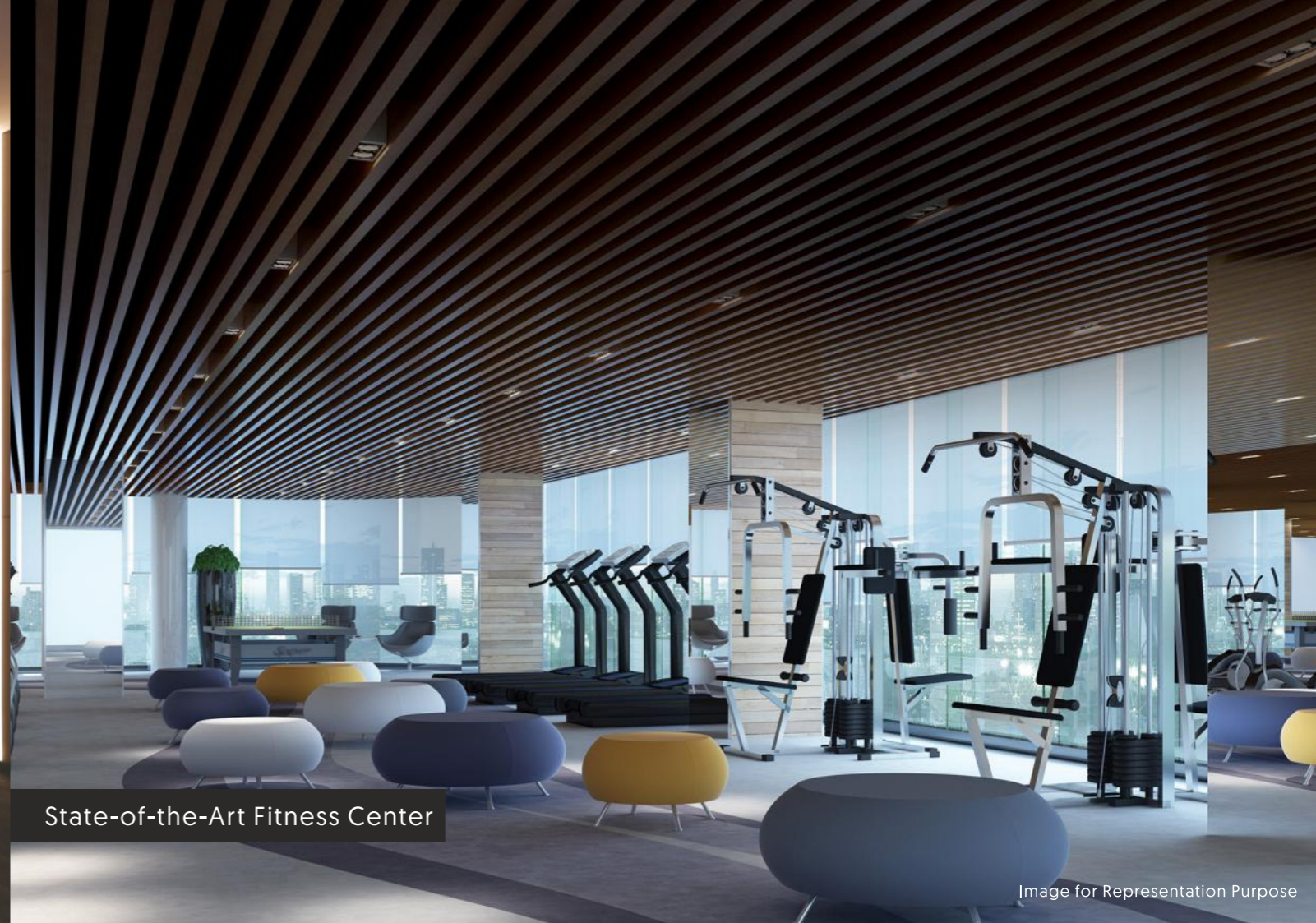
State-of-the-Art Fitness Center