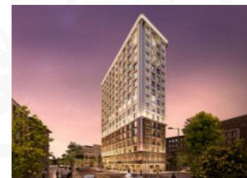
PLATINUM 53 WEST ANDHERI (W)