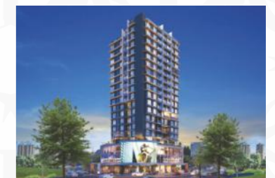
PLATINUM AVENUE KHAR (W)