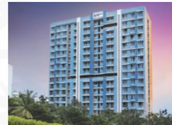
PLATINUM CASA DIVINE ANDHERI (W)