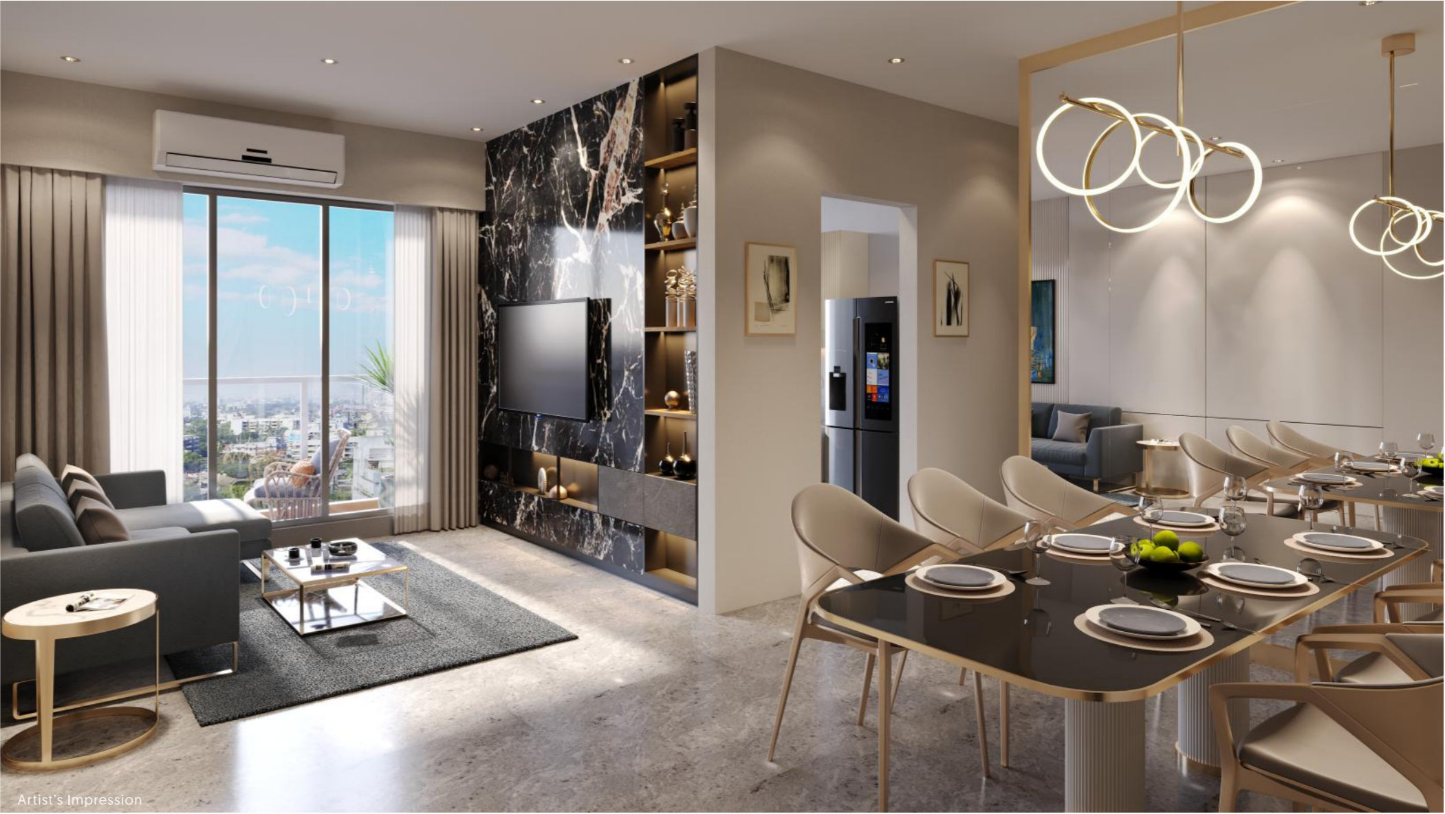
Well-Designed Living & Dining Spaces