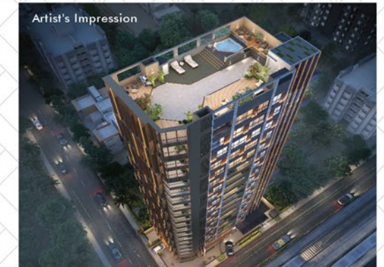
PLATINUM VISTA KHAR (W)