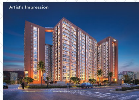
PLATINUM LIFE ANDHERI (W)