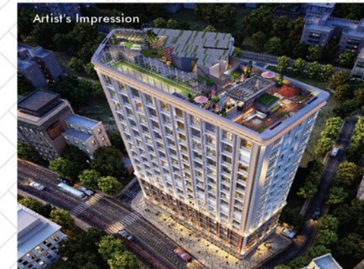
PLATINUM 53 WEST ANDHERI (W)