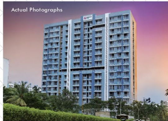
PLATINUM CASA DIVINE ANDHERI (W)