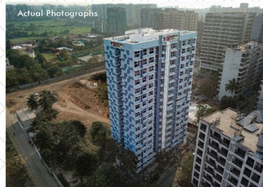
PLATINUM TOWER - 1 ANDHERI (W)