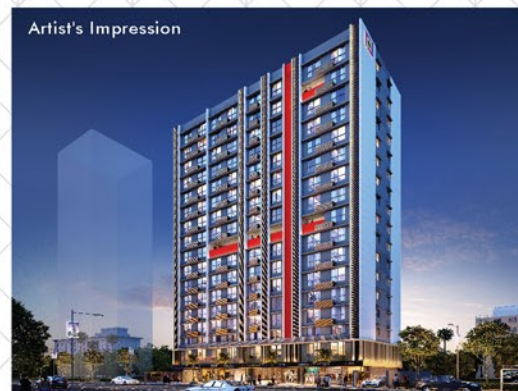
PLATINUM CASA MILLENNIA ANDHERI (W)