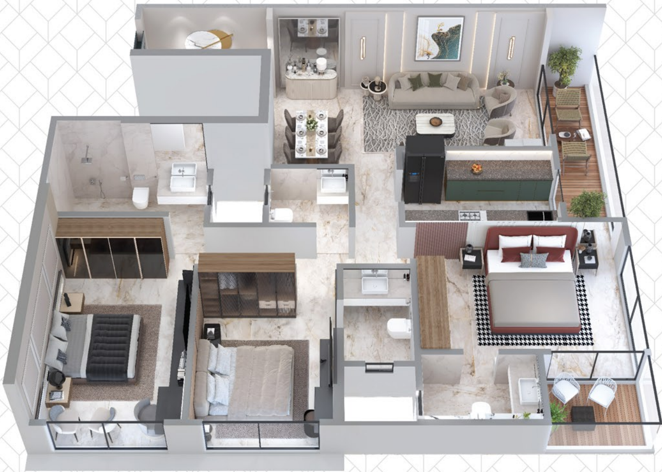
FLAT NO. 2