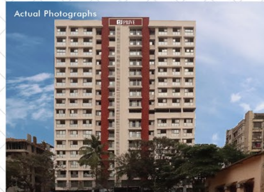
PLATINUM PRIVE ANDHERI (W)