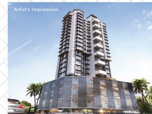
PLATINUM GRANDEUR MODEL TOWN, VERSOVA