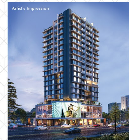
PLATINUM AVENUE KHAR (W)