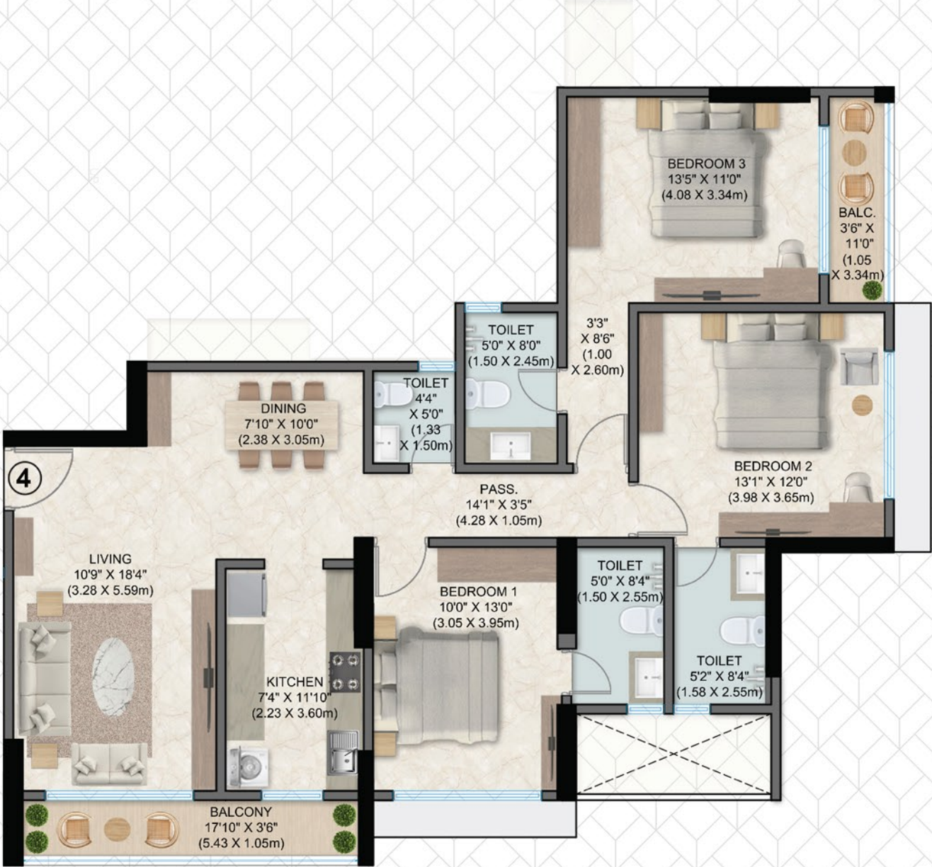
FLAT NO. 4