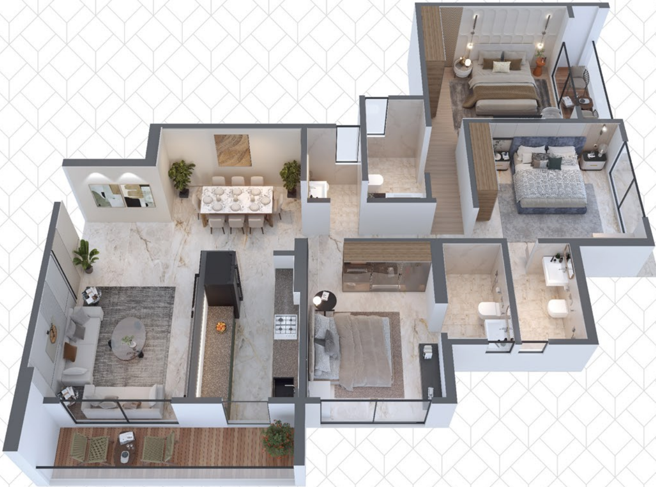
FLAT NO. 4