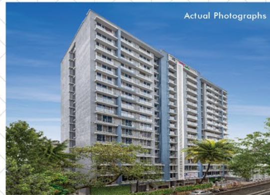
PLATINUM TOWER - 4 ANDHERI (W)