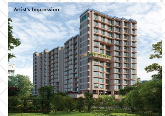
PLATINUM PARK ANDHERI (W)