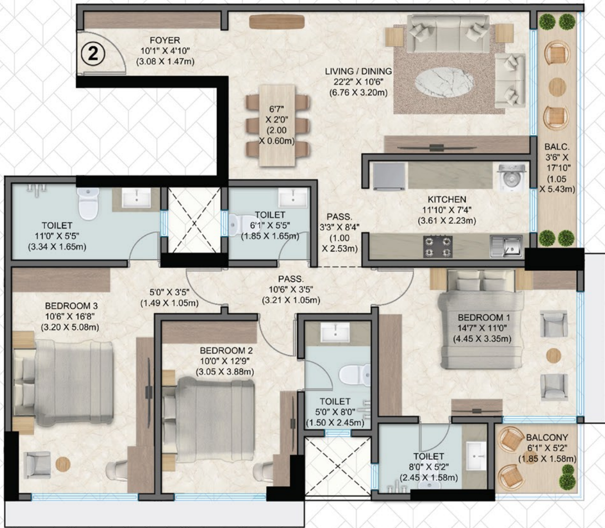
FLAT NO. 2