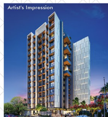
PLATINUM PRISTINE ANDHERI (W)